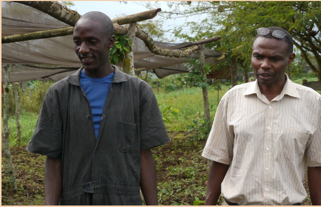
Coffee Seedling station