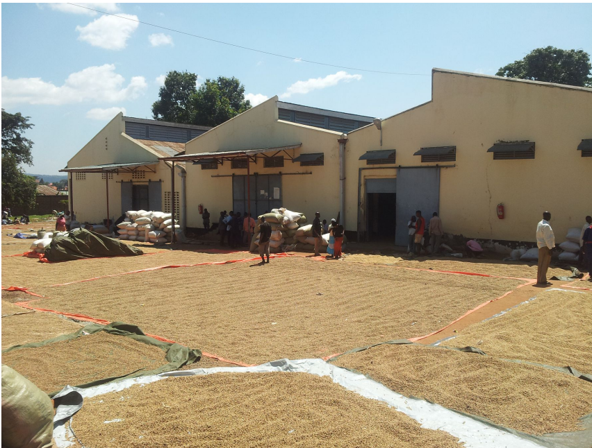
Coffee parchment drying outside the Gumutindu factory