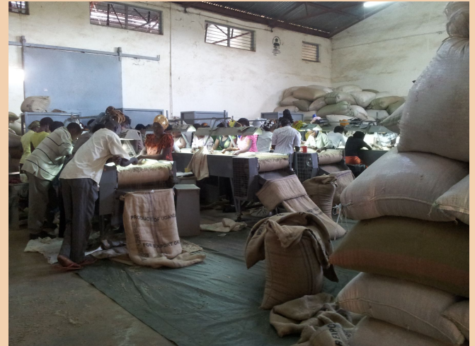
Coffee sorting stations in Gumutinudu's factory in Mbale